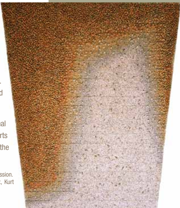
(top) Aggregation 07-D111A , 2007, mixed media, Korean mulberry paper, 78-3/4" x 78-3/4", photo courtesy of the artist