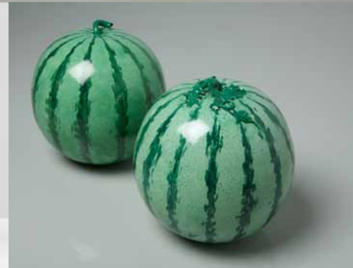
Watermelons , 2006, porcelain and glaze, height 17 1/2” x diameter 15”