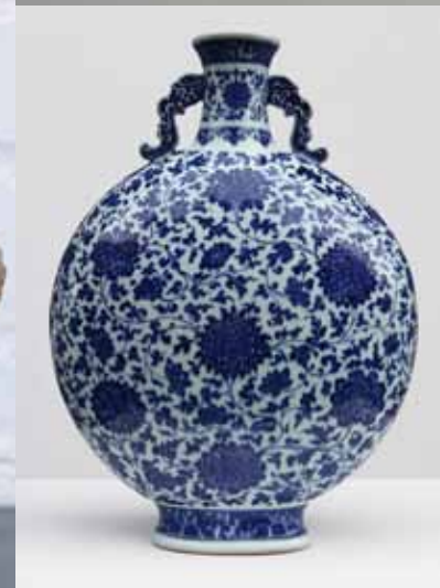
(left) Blue-and-White Moonflask , 1996, replica in style of Qing dynasty, Qianlong reign era (1736-95), porcelain, glaze and cobalt brushwork, 20 7/8” x 14 1/2” x 6” Courtesy private collection, USA