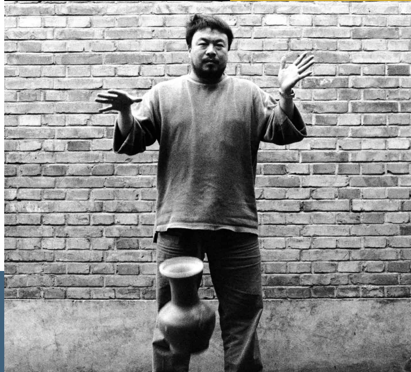
Ai Weiwei: Dropping the Urn (Ceramic Works, 5000 BCE-2010 CE) May 13-August 7, 2011