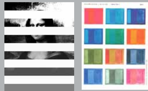
(above) Peter Coffin, Untitled , 2009.