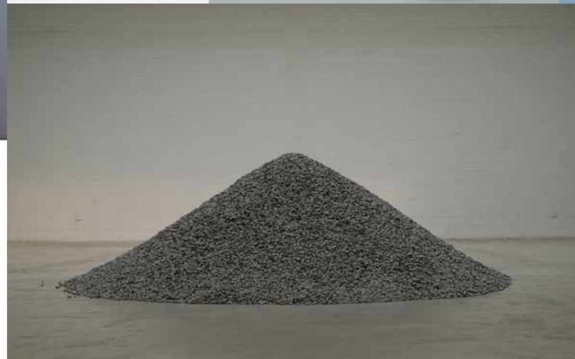
Kui Hua Zi , 2006, porcelain and paint, 1 ton, diameter approximately 80”