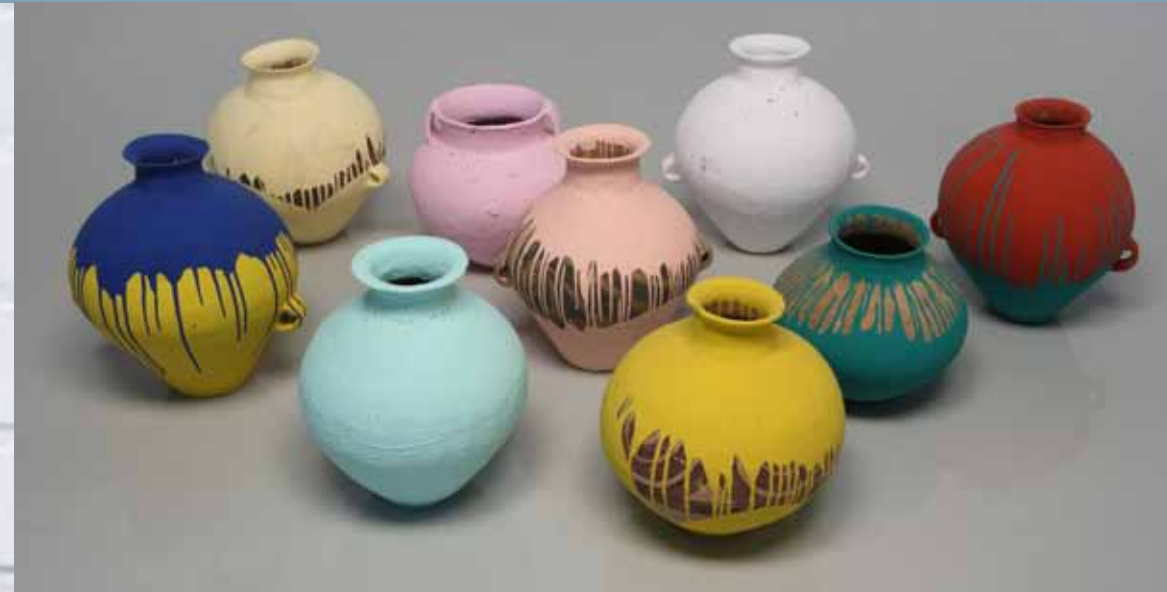
Colored Vases , 2006/2008, vases from the Neolithic age (5000–3000 BCE) and industrial paint. 9 pieces, dimensions variable (smallest piece: height 10” x diameter 9”; largest piece: height 14 1/2” x diameter 9”)